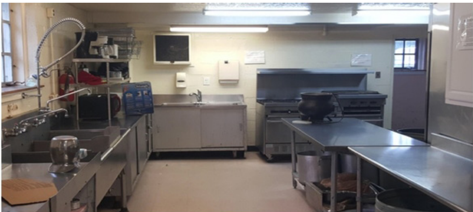
Kitchen with double commercial freezer and refrigerator - 10 person capacity