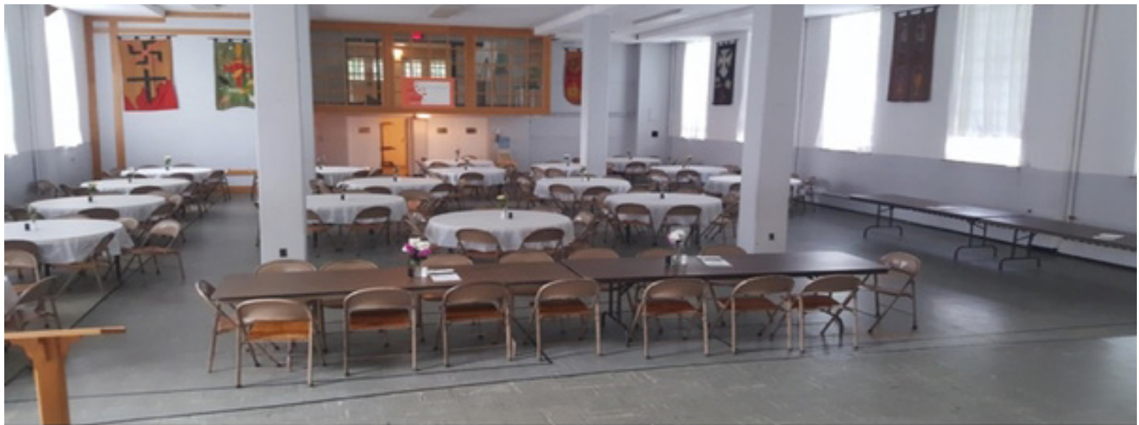
Dorothy Harris Auditorium, 200 person seated capacity

The Dorothy Harris auditorium is located on the ground level of the Education Building. It is approximately 43' wide by 52' long and includes a 22' wide by 16' deep raised stage. There is access to three bathrooms, including an ADA bathroom. Seating capacity is 399 standing and 190 with tables and chairs. The kitchen is located at the rear of the auditorium. It includes an eight-burner commercial range and oven, three sinks, refrigerator, freezer, garbage disposal, stainless steel countertops and cabinets for storage.